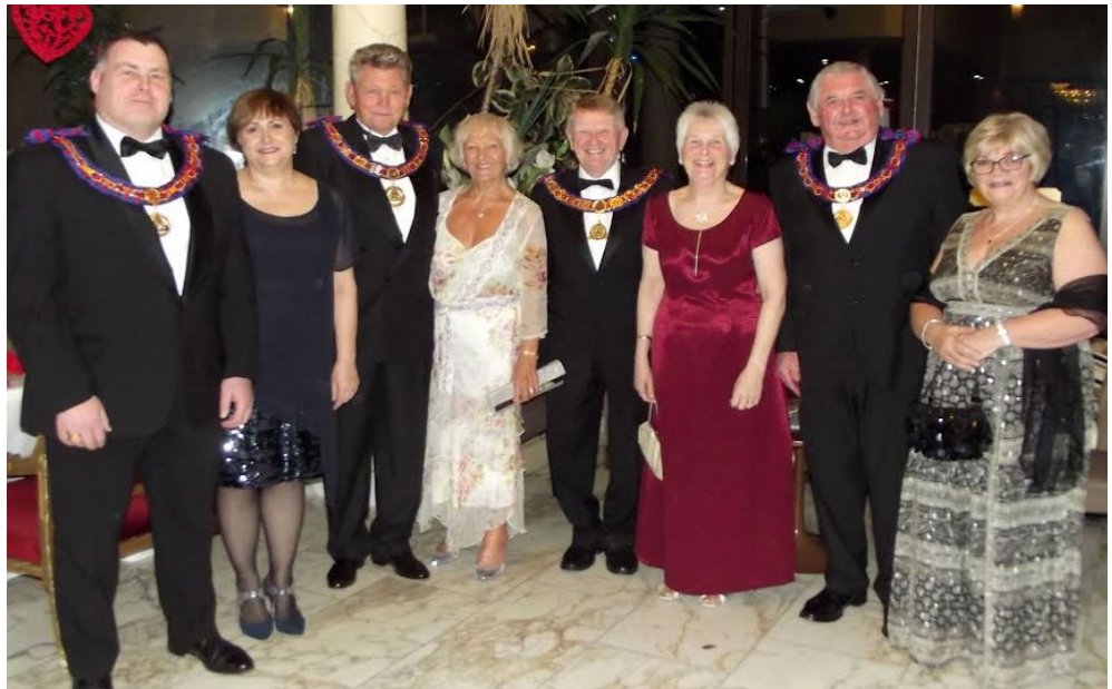
The Dorset Companions ready to raise another glass