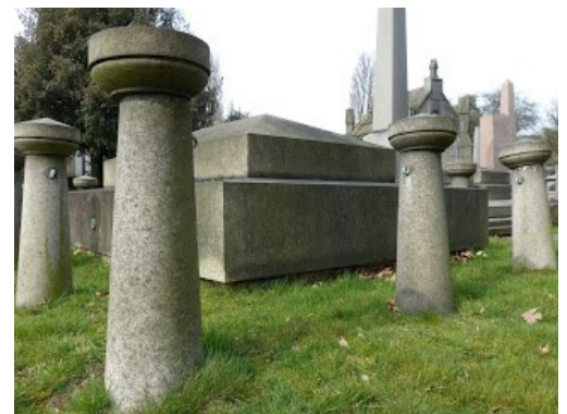
The Grave of Augustus, Kensal Green, London

The Duke of Sussex died on 21st April 1843 at Kensington Palace from a skin infection sometimes known as St Anthony's Fire. He was buried in the public cemetery at Kensal Green, later Lady Cecilia was buried beside him.